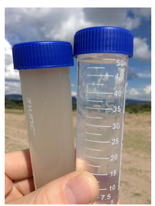
Before and after: river water after passing through the filter system just once.